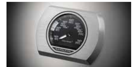
ACCU-PROBE™ temperature gauge