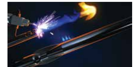
Instant JETFIRE™ ignition