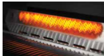
Rear infrared rotisserie burner