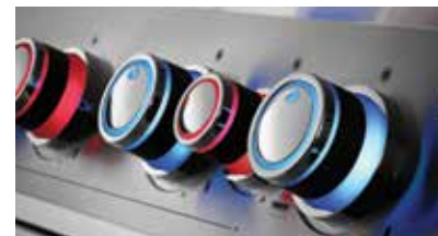
NIGHT LIGHT™ control knobs with SafetyGlow