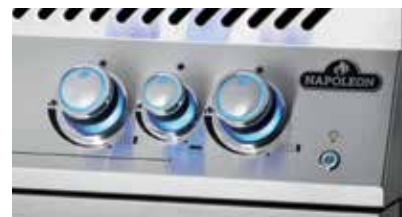
Backlit Control Knobs with SafetyGlow