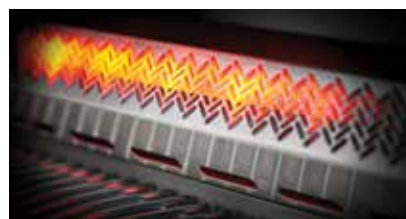
Dual rear infrared rotisserie burner