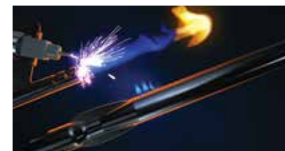
Instant JETFIRE ® ignition