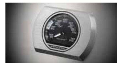
ACCU-PROBE ® temperature gauge