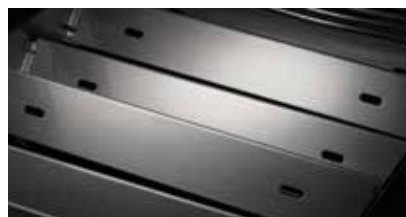
Dual-level stainless steel sear plates