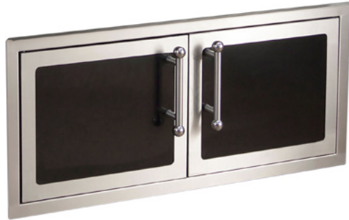
Double Access Doors 53938HSC