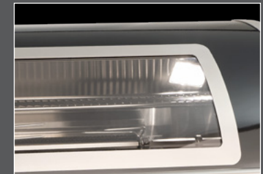
Magic View Window included