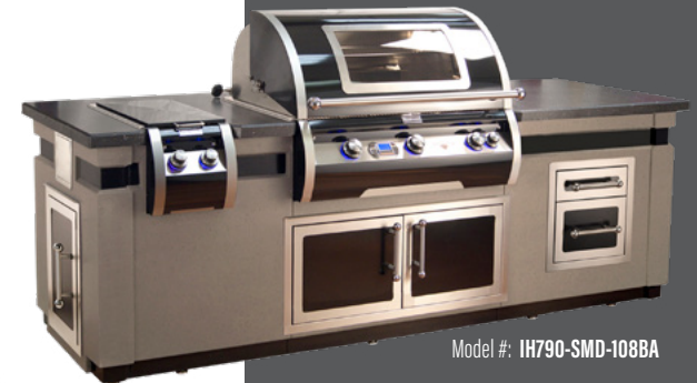
Model #: IH790-SMD-108BA