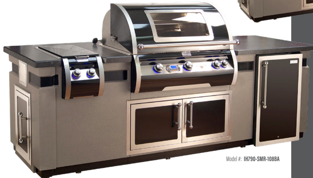
Model #: IH790-SMR-108BA