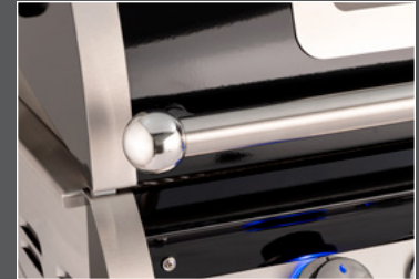
Black Porcelain Coated Finish with Satin Stainless Steel Accents