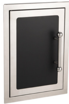
Single Access Door 53920HSC-L (-R)