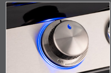
Satin Stainless Steel, Back-Lit Knobs