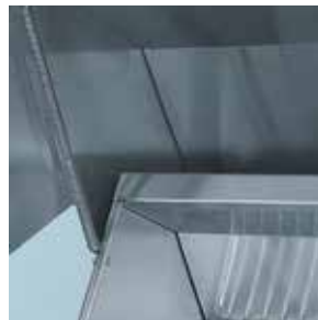
LYNX HOOD ASSIST

FOR MORE INFORMATION ON LYNX PROFESSIONAL PRODUCT FEATURES, PLEASE VISIT LYNXGRILLS.COM