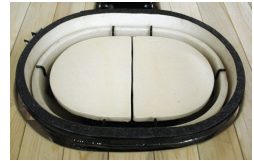
Heat Deflector Plates