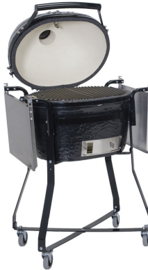
Cradle w/stainless steel sides table (featured with Oval Jr.)