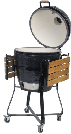
Cradle w/wood side tables (featured with Kamado)