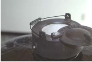
With Firebox Divider