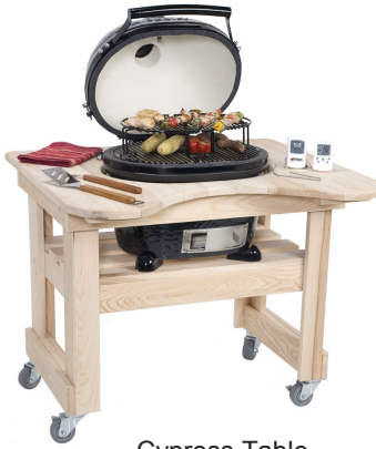
Cypress Table (featured w/Oval Jr.)