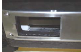
Without Firebox Divider