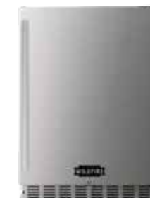
24" OUTDOOR FRIDGE