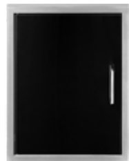
VERTICAL SINGLE DOOR 16" X 22" 304 BLACK STAINLESS

Available in Wildfire's Exclusive Black 304 Stainless Steel & 304 Stainless Steel