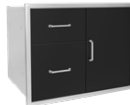
DOOR / DRAWER COMBO 30" X 24" 304 BLACK STAINLESS