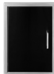
VERTICAL SINGLE DOOR 20" X 27" 304 BLACK STAINLESS