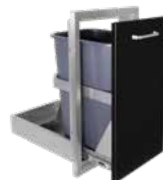
PULL OUT TRASH DRAWER 14" X 26" 304 BLACK STAINLESS