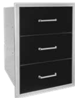
TRIPLE DRAWER 19" X 26" 304 BLACK STAINLESS