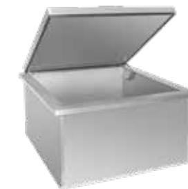
ICE CHEST (LARGE)