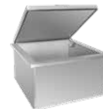
ICE CHEST (SMALL)