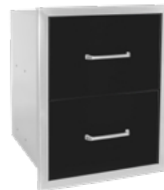
DOUBLE DRAWER 16" X 22" 304 BLACK STAINLESS