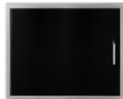
HORIZONTAL SINGLE DOOR 27" X 20" 304 BLACK STAINLESS