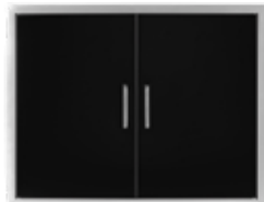
DOUBLE DOOR 30" X 24" 304 BLACK STAINLESS