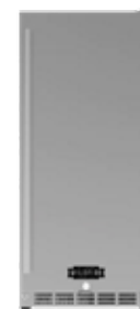
15" OUTDOOR FRIDGE