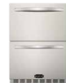
24" DUAL DRAWER FRIDGE